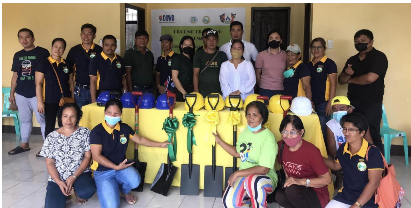
Express Support to KALAHANGI CIDSS implementations.