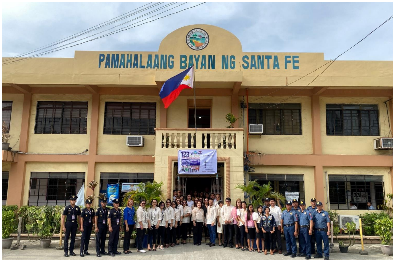
Enjoyed with the celebration of the 123 rd Philippine Civil Service Anniversary