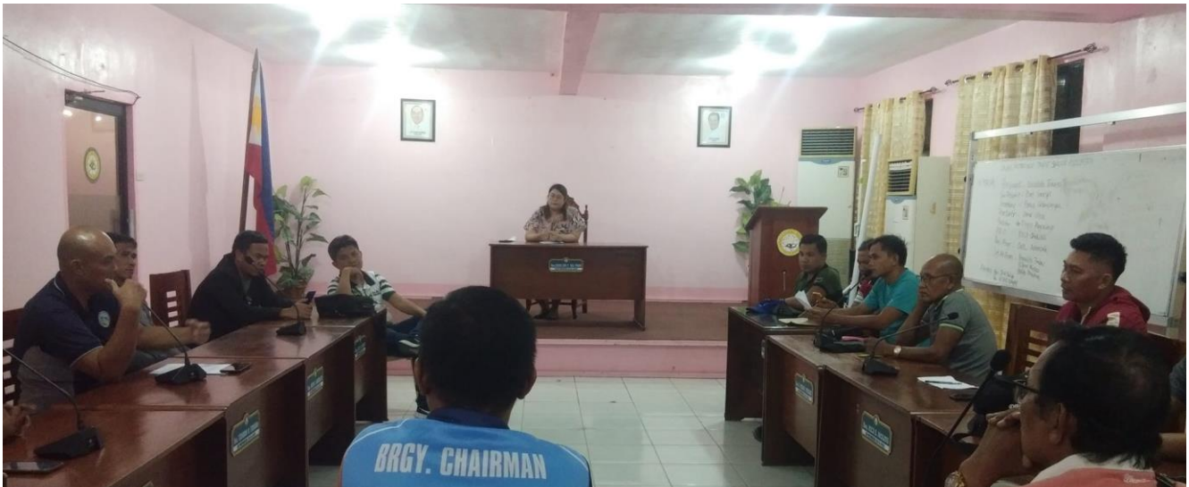
October 11, 2023 . the ASF Municipal Task Force headed by Municipal Vice Mayor as Acting LCE together with the Committee of Agriculture attended for an emergency meeting on strengthening measures in preventing the outbreak of the possible case of African Swine Fever in the municipality.

The Sanggunian of Santa Fe is pro-active and in full cooperation with the Executive Department to ensure that basic services and effective and adequate response will be provided to its citizenry.