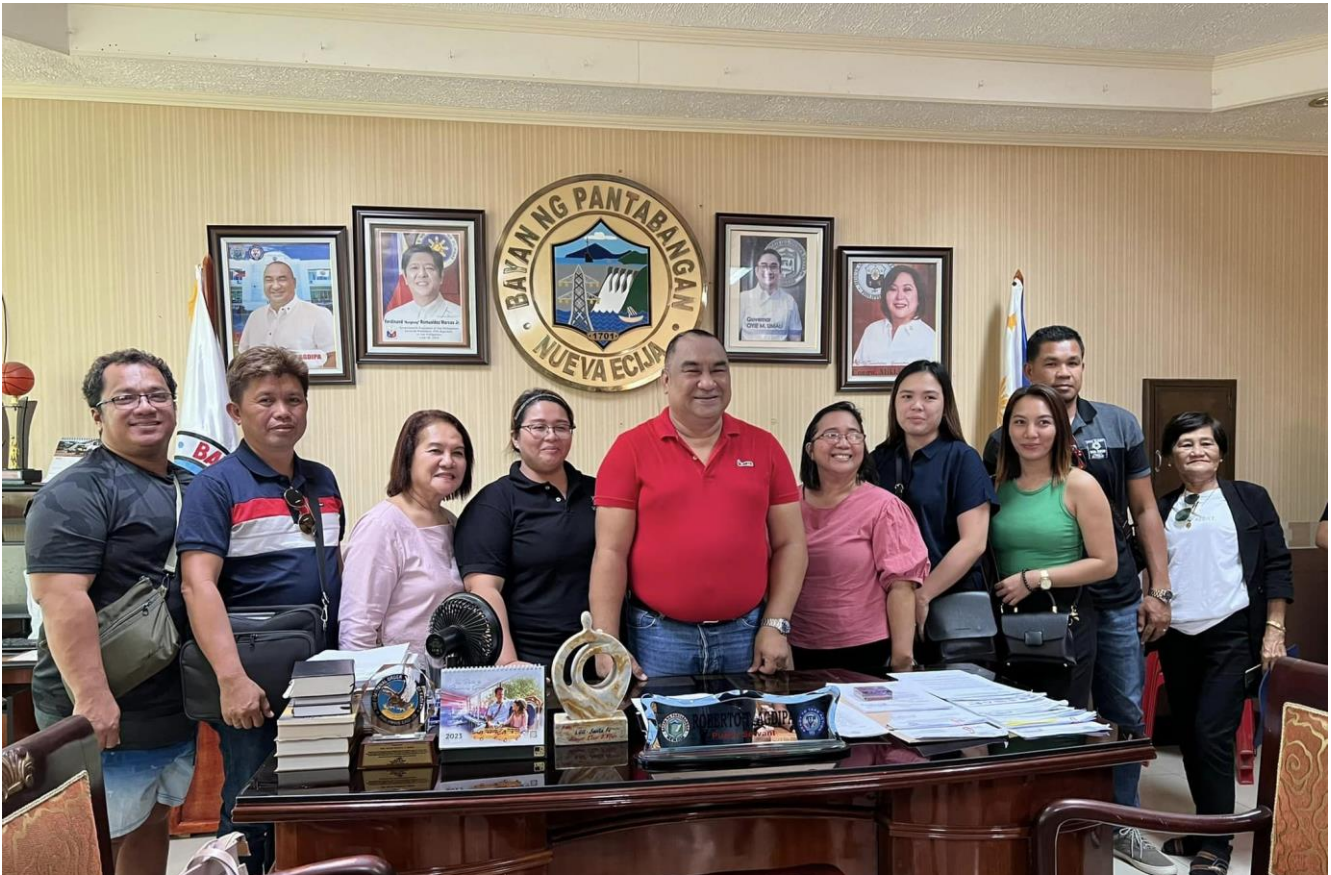
Attended and Participated in LGU Annual Capability Trainings and Seminar.