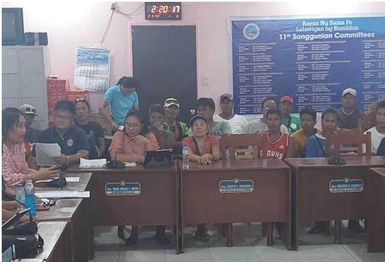
On September 28, 2023, the Committee on Public Works and Infrastructure conducted a Public Hearing regarding on the Privilege Matter; Save Santa Fe Landmark from indecent activities.