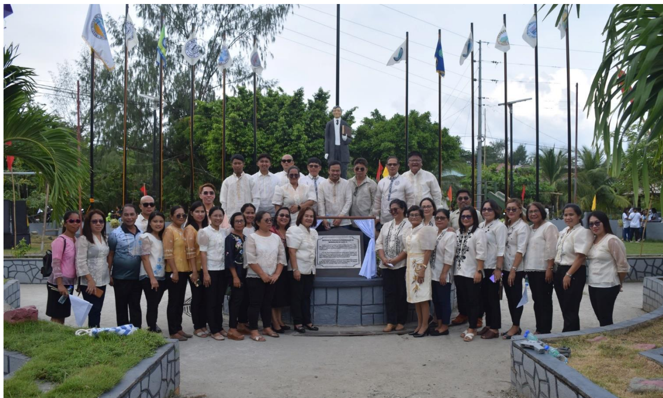
Enjoyed with the celebration of the 77th Founding Anniversary of Santa Fe on October 1, 2023