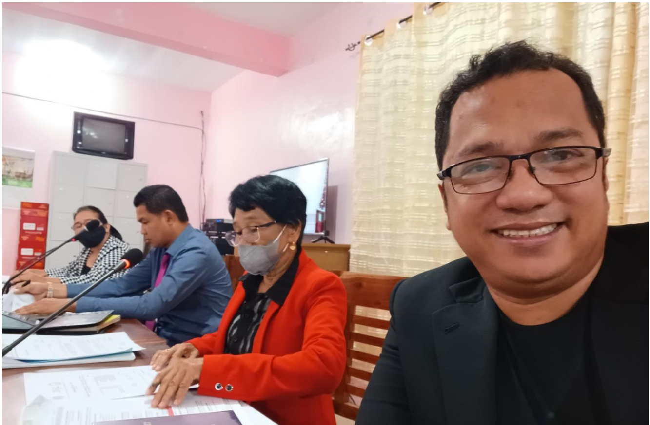
Joint Committee Hearing – Committee of Appropriation and Finance & Committee on Health conducted a consultation meeting with the Municipal Health Office regarding on their proposed PPAs for the succeeding year.

For this year, the Committee/s concerned conducted 72 Committee Hearings starting from January 2023 until the end of December 2023.