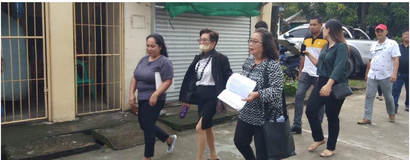
July 28, 2023 . Ang ating tanggapan kasama ng mga empleyado at opesyales ng Local na Pamahalaan ng Santa Fe, mga kawani ng Barangay at opesyales ng National Agencies ay nakiisa sa Nutrition Month Celebration. Sinimulan ang program ng isang foot parade.