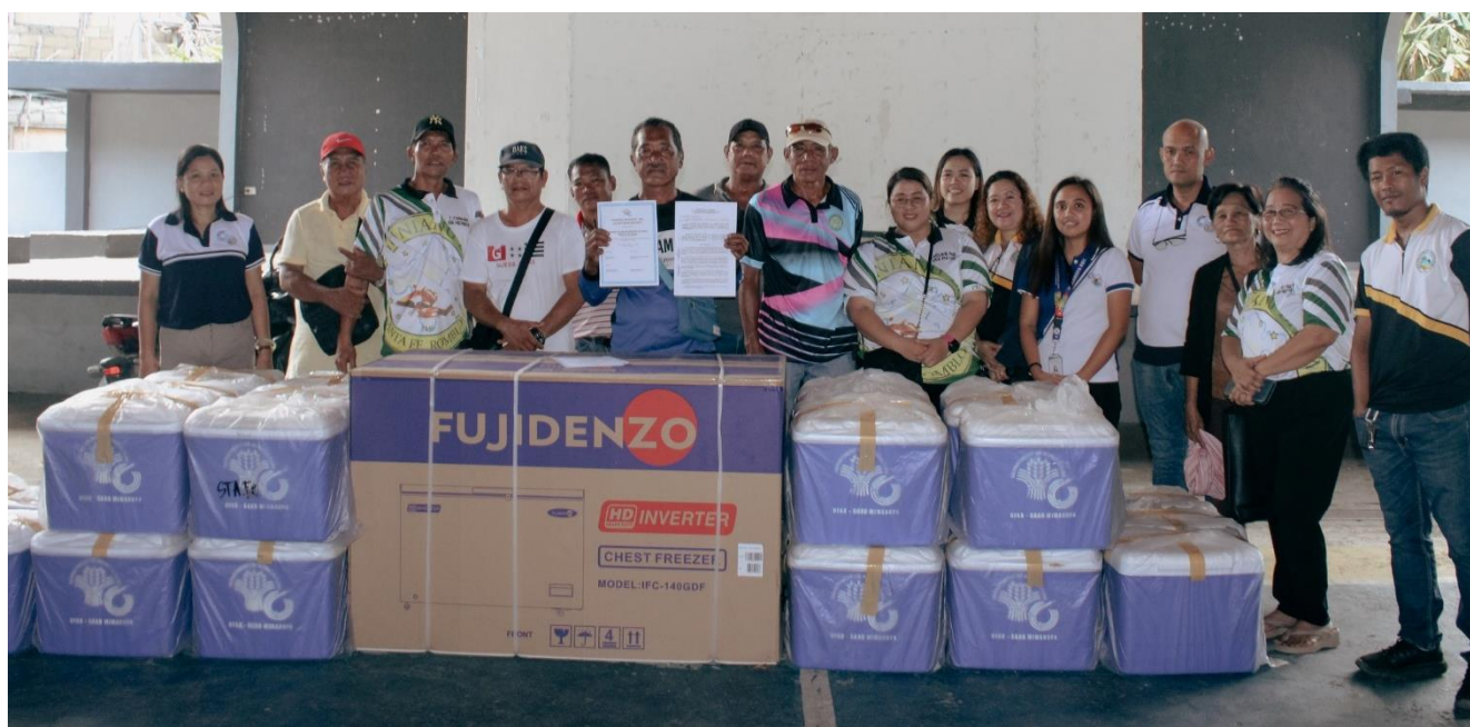
On September 2023 the Sanggunian through its Presiding Officer witnessed the distribution of interventions to fisher-groups from the municipalities of Sta. Fe facilitated by the Bureau of Fisheries and Aquatic Resources – Special Area for Agriculture Development (SAAD) Program in their commitment to uplifting the lives of local fisherfolk associations (FAs).