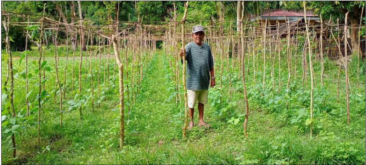
Barangay Danao Norte