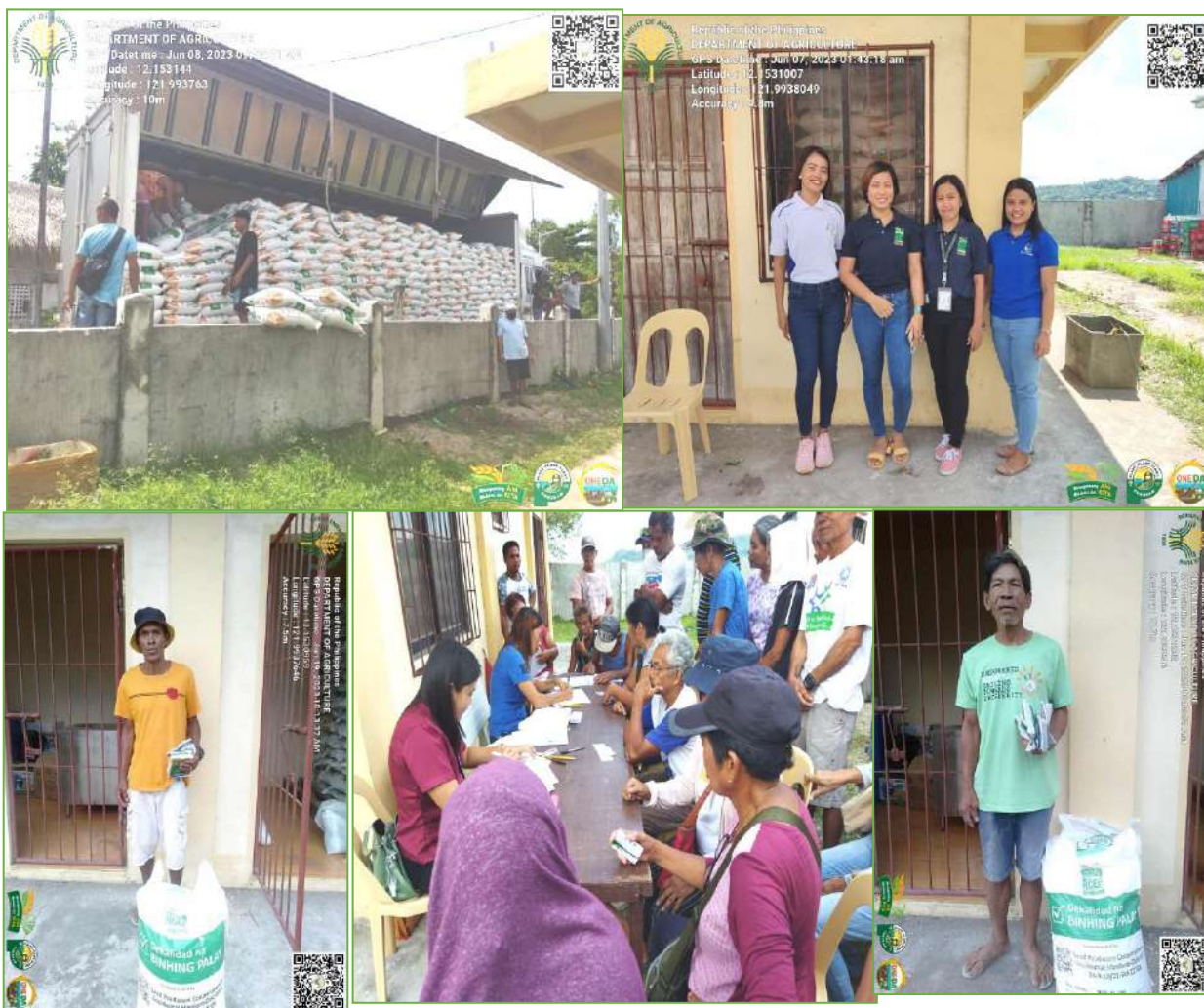
During the hauling and distribution of certified rice seeds and BIO-N for wet season 2023.

Last June 8, 2023 the DA-LGU received 950 bags of certified inbred rice seeds from PhilRice under Rice Competitiveness Enhancement Fund (RCEF) containing 20 kgs/bag which is good for 267 hectares. It was utilized during wet season by 759 eligible rice farmers and reported as planted and harvested. Also, the farmers received a packs of BIO-N that serve as initial fertilizer to their certified rice seeds under rice program.