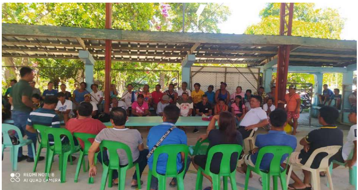
Fisherfolks meeting conducted last July 2023 at Brgy. Agmanic Covered Court