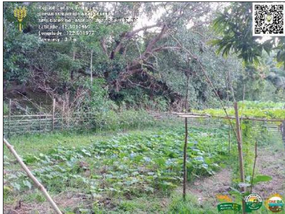
Barangay Danao Sur