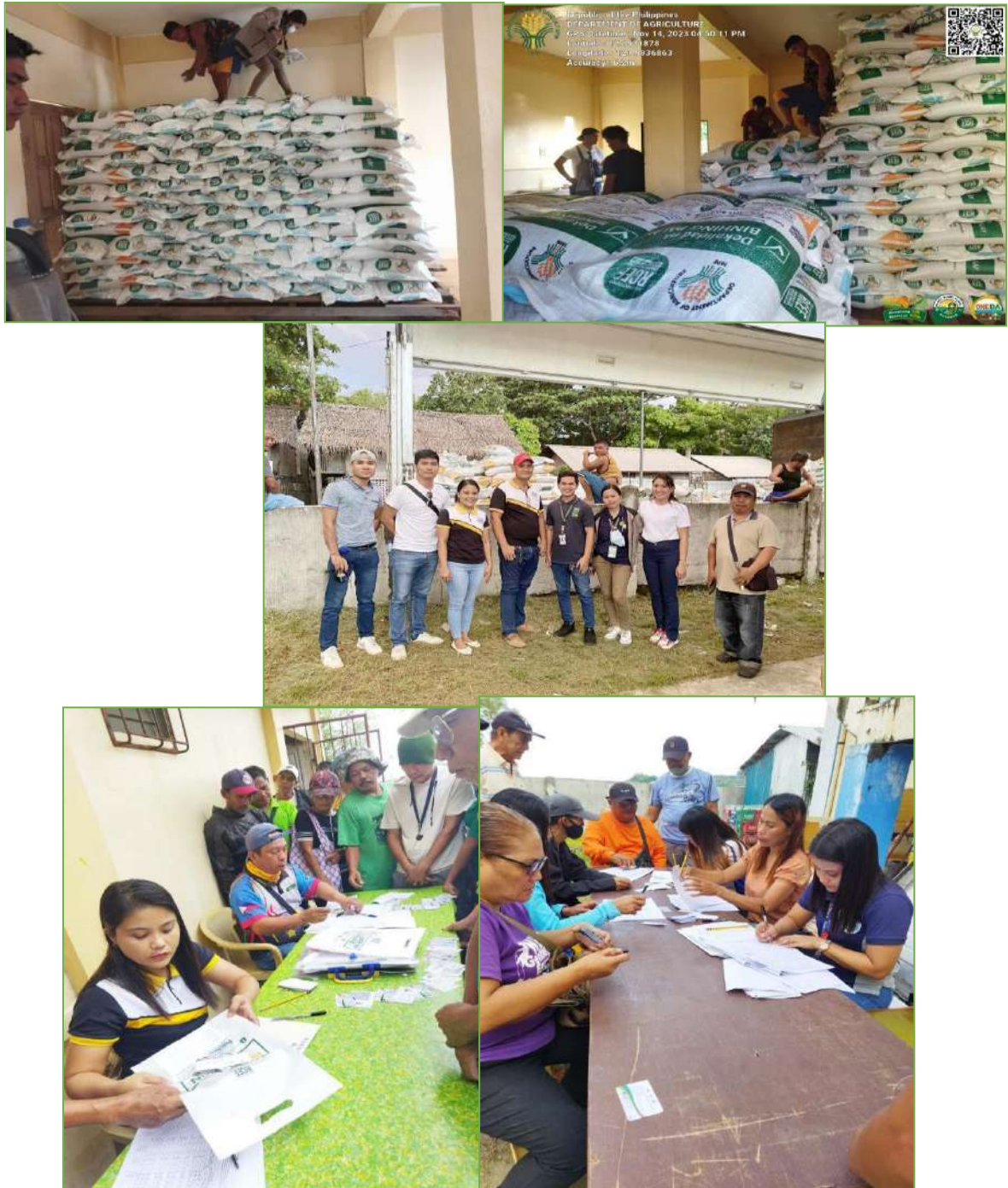
During the hauling, distribution of certified rice seeds, and KP Kits for dry season 2023.

Last November 14, 2023 the DA-LGU received 950 bags of certified rice seeds from PhilRice under Rice Competitiveness Enhancement containing 20 kgs/bag which is good for 282 hectares. It was utilized during dry season by 759 eligible rice farmers and reported as planted. In addition, we distributed 280 Knowledge Product Kits with 280 beneficiaries.