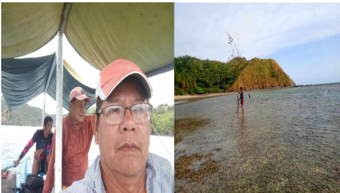
Installation of buoy marker and conducted surveillance of illegal fishers at Puro Island Fish Sanctuary and Sabang Cove Fishery Management