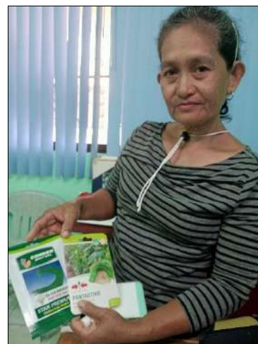
Random photos taken during the distribution of vegetables seeds.