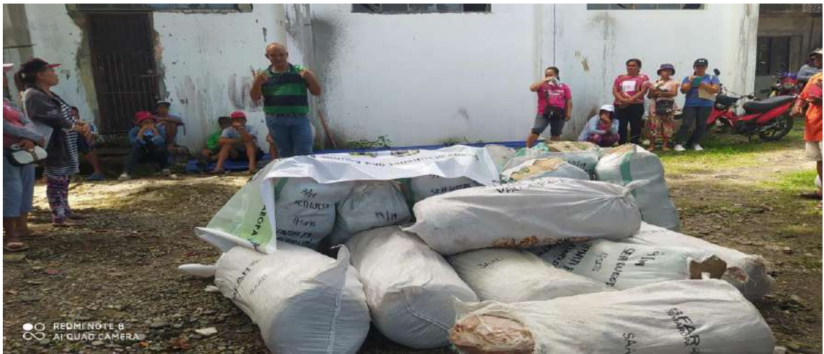
Distribution of Livelihood assistance to eight (8) Fisherfolks Associations of the Municipality.