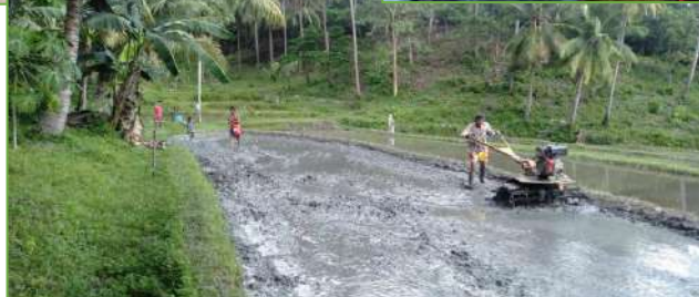
Biocomposting Facility, Harvester , Thresher and Hand Tractor.